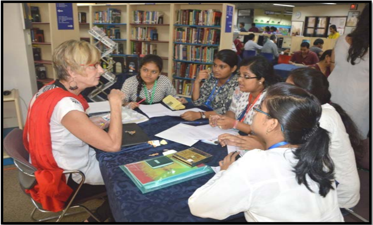
LIBRARY SESSION AT AMERICAN CENTRE