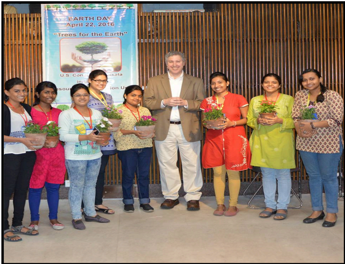
EARTH DAY CELEBRATION AT AMERICAN CENTRE