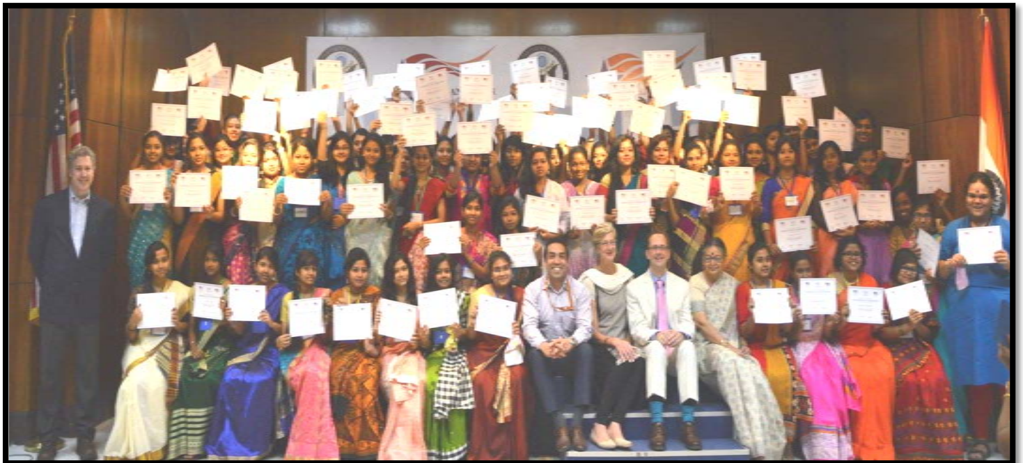
ON CLOSING DAY- STUDENTS WITH THEIR CERTIFICATES