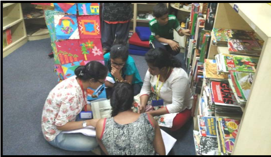
SCAVENGER HUNT AT AMERICAN CENTER