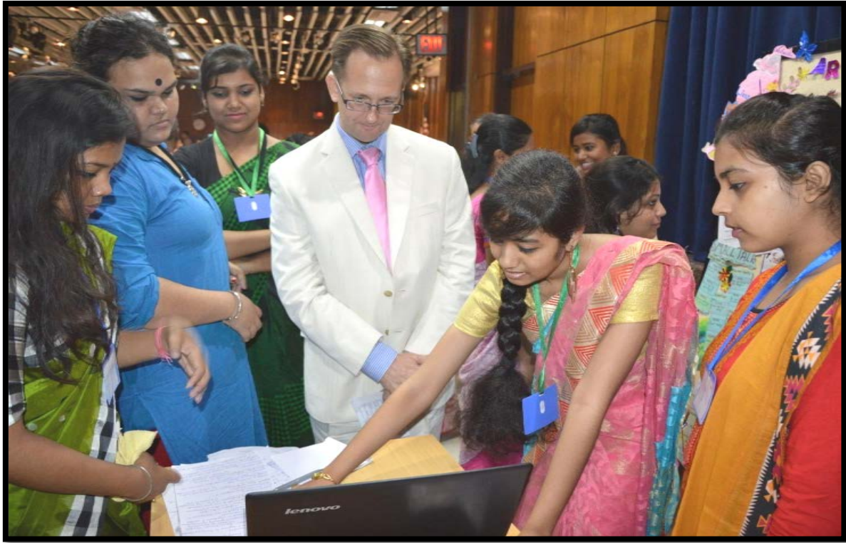
GALLERY WORK PRESENTATION BY THE STUDENTS